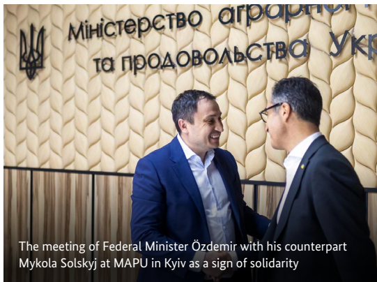
The meeting of Federal Minister Özdemir with his counterpart Mykola Solskyj at MAPU in Kyiv as a sign of solidarity

Since then, more than 589 truckloads of food have been delivered to the regions in Ukraine most affected by the war through the German Food Bridge. The close cooperation between NGOs, policymakers, and industry is a strong sign of solidarity with the Ukrainians. In addition, the BMEL has implemented and launched a series of measures to alleviate the consequences of the war and support reconstruction. It did so by building on professional and political networks that already existed before the war due to the BMEL's Bilateral Cooperation Programme. Additionally, the Bilateral Trust Fund (BTF) with the Food and Agriculture Organisation of the United Nations (FAO) was used in a focused way. This overview provides an insight into the BMEL's current portfolio of