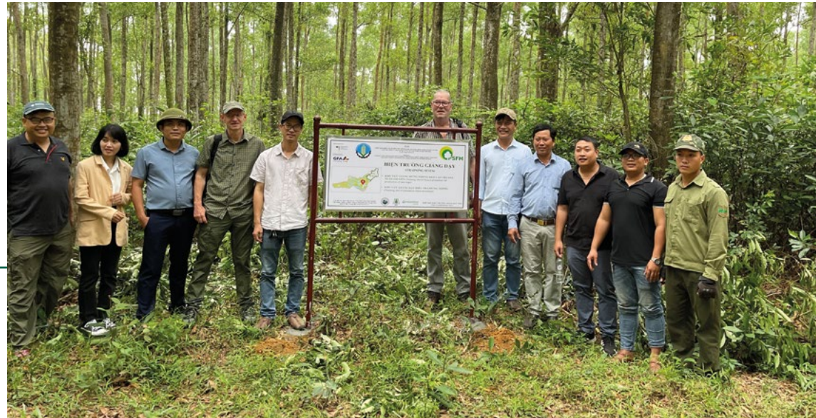
Training for the application of silvicultural techniques in acacia plantations

of recognized training in the area of forestry. The Forest Training Center in Dong Ha was established by the Vietnamese Academy of Forestry Science (VAFS), with support from the BMEL, during the initial project phase. The center offers practice-oriented training. In the second phase, the project aims to further develop skills for applying forest management methods in state-run and smallholder forestry operations.