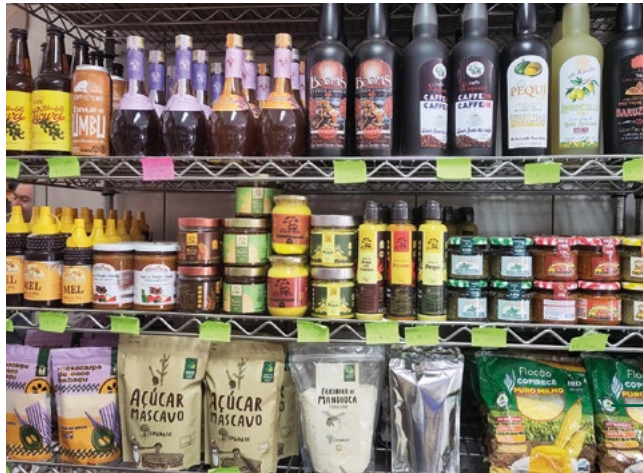
Improving sustainable management of the Brazilian Cerrado through quantifying and valorizing the ecosystem services of autochthonous silvopastoral systems – Brazil

In addition, the project provides further training for consultants and farmers in silvopastoral pasture farming, and helps train young German and Brazilian scientists. Furthermore, sustainable farming practices are being developed that will reduce further deforestation and land degradation in the Cerrado, which can then also be applied to other dry forest and savanna regions.