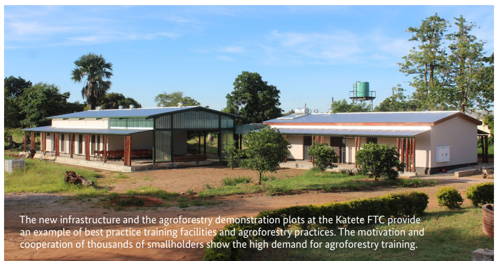
The new infrastructure and the agroforestry demonstration plots at the Katete FTC provide an example of best practice training facilities and agroforestry practices. The motivation and cooperation of thousands of smallholders show the high demand for agroforestry training.