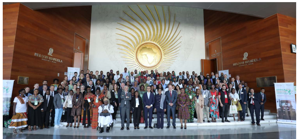
The African Youth Agribusiness Forum