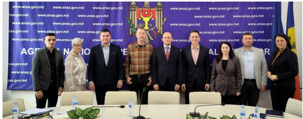
Meeting with the leadership of ANSA in the context of the training of Moldovan slaughterhouse inspectors (December 2024)