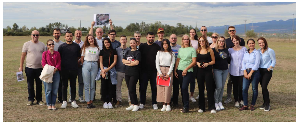
The first summer school brought together participants from five Western Balkan countries to learn about the geospatial foundations of the Integrated Administration and Control System (IACS). The image shows the participants in the summer school.